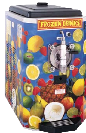
Shown with optional panel decals