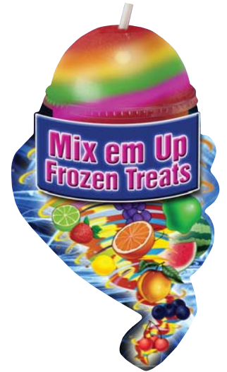
Floor Graphic 10.25''w x 18''h