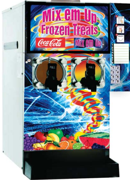
Machine Graphics - 300