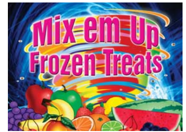
Dangler 15.25''w x 11.25''h