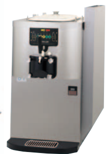
Optional Top Air Discharge Chute